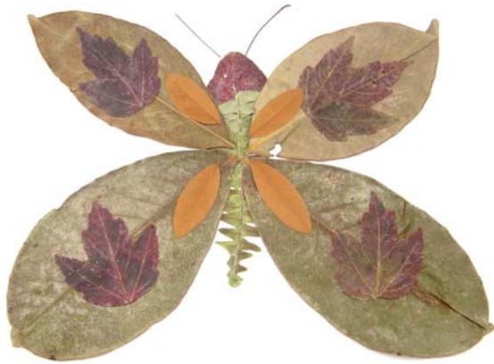
Student leaf collage