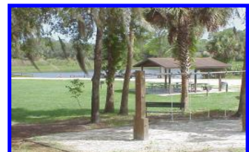
LAKE MONROE PARK 2002 Grant - $492,800