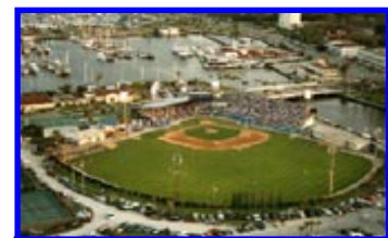
JACKIE ROBINSON BALLPARK 2003 Grant - $500,000