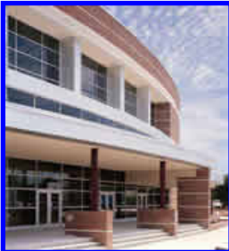
MARY MCLEOD BETHUNE PERFORMING ARTS CENTER 2004 Grant - $500,000

The ECHO Grants-In-Aid Program is a “bricks-and-mortar” program that provides grant funds to finance acquisition, restoration, construction, and/or improvement of facilities to be used for environmental/ecological learning, cultural, historical/heritage, or outdoor recreation purposes that must be open for public use. Applicants to the ECHO Grants-In-Aid program must be not-for-profit 501(c)(3) organizations incorporated in the State of Florida with their principal place of business located in Volusia County, municipalities located within Volusia County, or budgeted departments within the County of Volusia Government. ECHO awards are issued annually by the County Council.