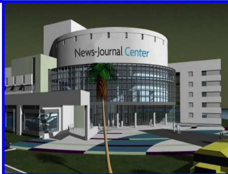
NEWS JOURNAL CENTER FOR THE PERFORMING ARTS Exceptional Grant - 2003-2006 - $2,400,000

Created by a voter-approved referendum, the ECHO Grants-In-Aid Program serves the citizens of Volusia County through restoration, creation, and expansion of facilities within the County, used for E nvironmental learning, C ultural events, H istorical/ H eritage preservation, or for O utdoor recreation.