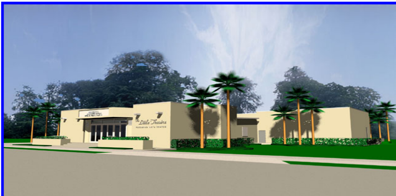
LITTLE THEATER OF NEW SMYRNA BEACH 2003 Grant - $467,000

Created by a voter-approved referendum, the ECHO Grants-In-Aid Program serves the citizens of Volusia County through restoration, creation, and expansion of facilities within the County, used for E nvironmental learning, C ultural events, H istorical/ H eritage preservation, or for O utdoor recreation.