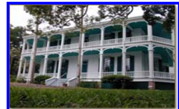
DEBARY HALL 2002 & 2004 Grants - $735,000