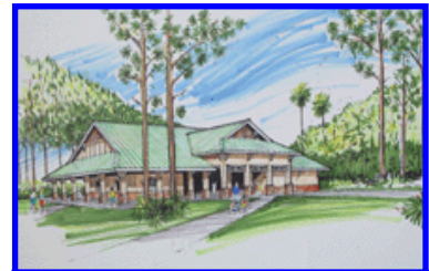
PORT ORANGE CITY CENTER AMPHITHEATER PAVILION 2004 Grant - $420,000

An ECHO Steering Committee was formed with the inaugural meeting held March 20, 2000. The Committee’s purpose was to gather citizen input on the ECHO initiatives (referendums), funding options, and development and then forward that report to the County Council for consideration.