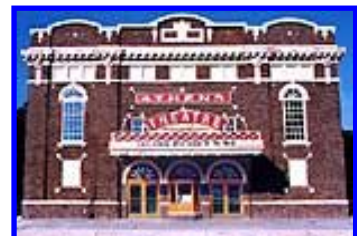
ATHENS THEATER 2002, 2004, 2005, 2006, 2007 Grants - $1,242,000